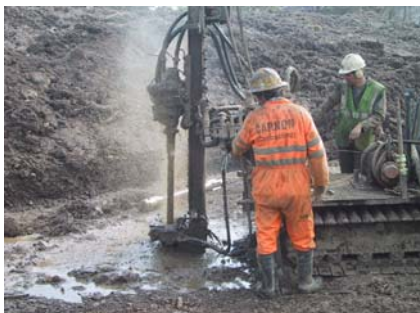
Piling for a new housing scheme at Helston, Cornwall